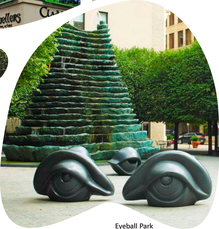
Eyeball Park Agnes R Katz Plaza - Pittsburgh, PA