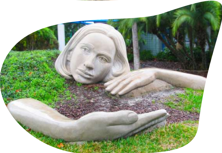
Lady With a Green Blanket Lake Eola Park - Orlando, FL