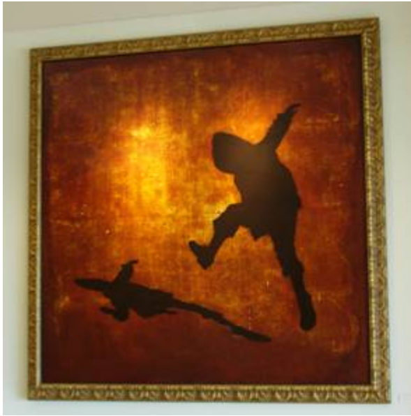
Jumping Boy and Girl ("Boy" pictured), Dorothy Rissman. Located at the south entry vestibule, third floor.