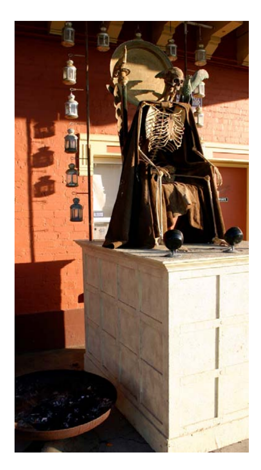
Skeleton Sculpture, Fourth Street

Social and Public Art Resource Center <u>www.sparcmurals.org</u>